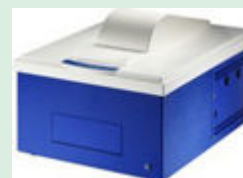
Viral neuraminidase inhibition assay (NA-Star detection kit, Applied Biosystems) was measured with Centro LB 960

Some techniques for generating and/or detecting light in biological subjects are patented and may require licences from third parties. Users are advised to independently determine for themselves whether their activities infringe any valid patent.