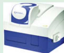
Caspase Assay was measured in TriStar LB 941 - samples from various clam species!