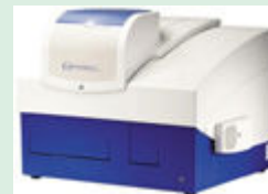
Calcium Assay with Fura-2 measured with Mithras LB 940