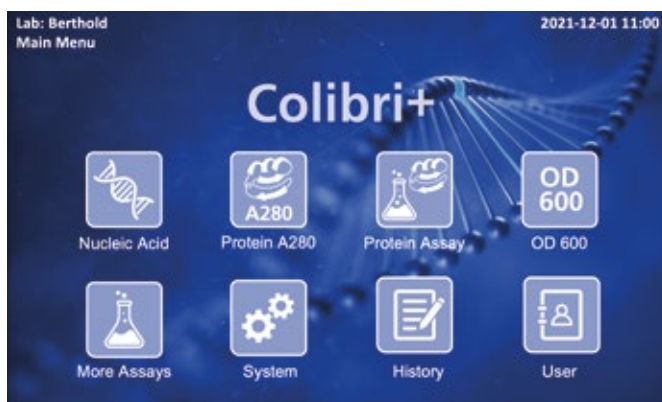
Figure 3: Intuitive touchscreen operation and a wide variety of preprogrammed protocols simplify operation of the system.